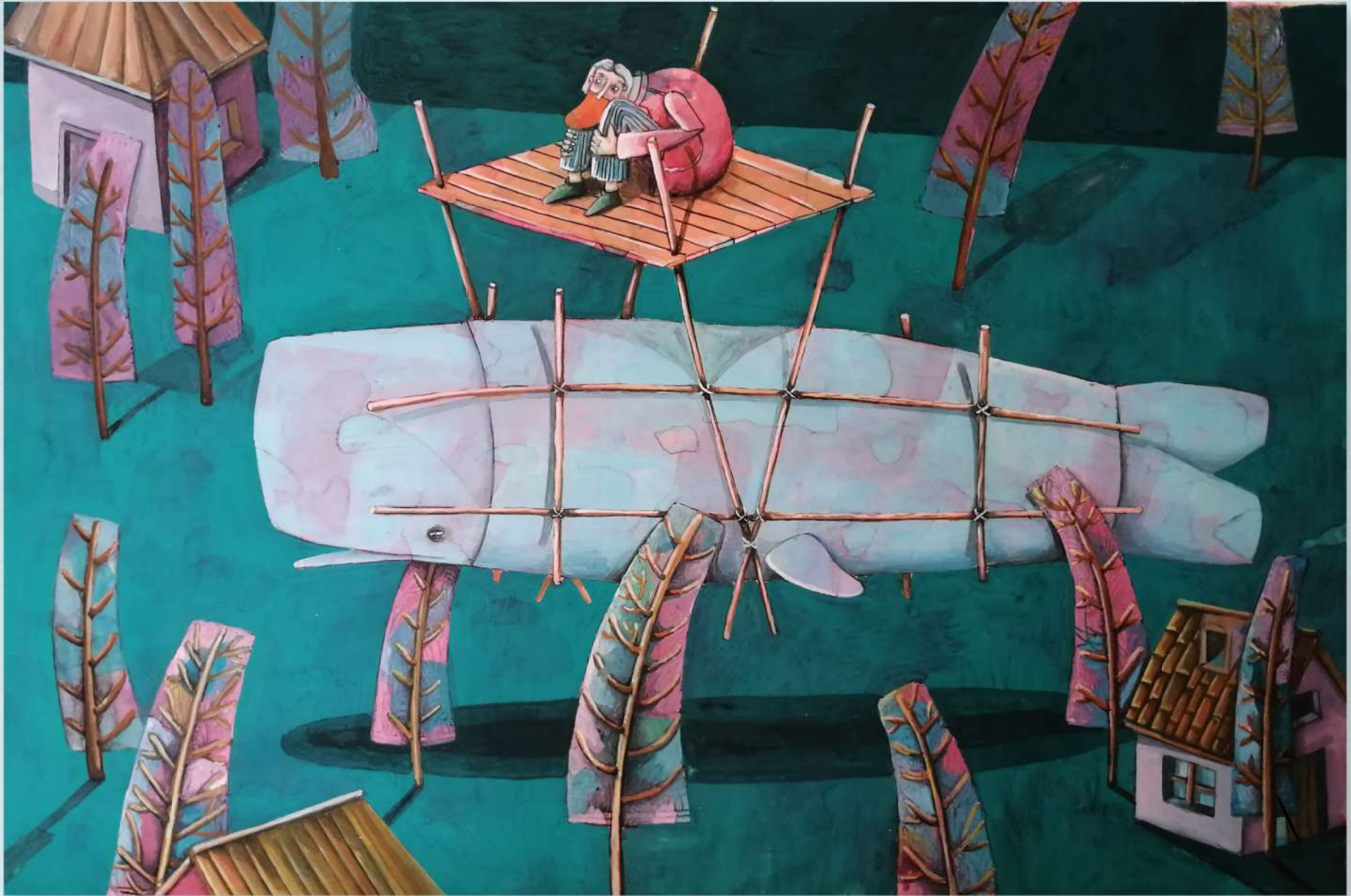
The story of "Jonah and the whale", which was performed for a workshop. I performed this artwork with the combination of ecolin and gouache techniques.