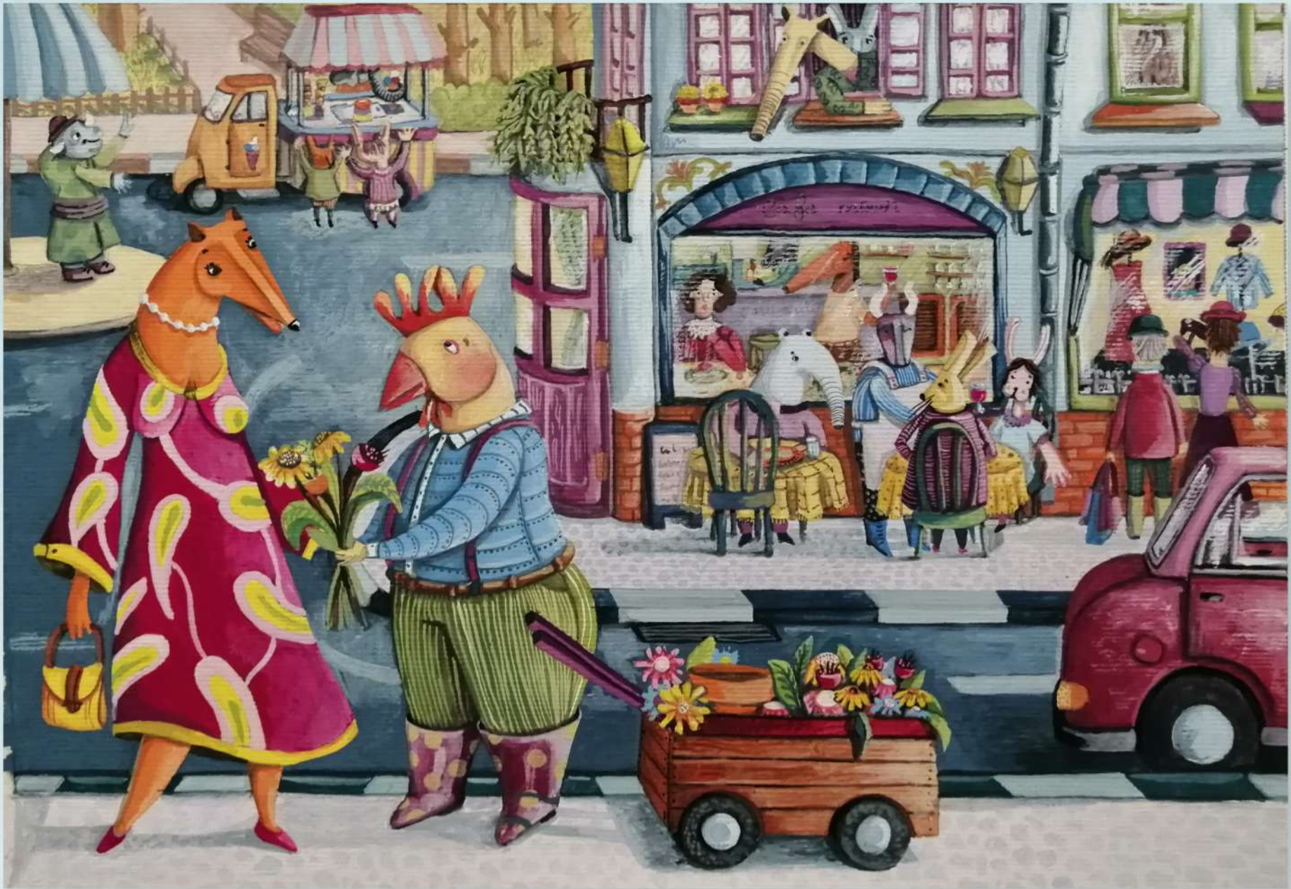
A single-frame illustration with the subject of a "cafe on the street", was performed by the gouache technique and a combination of 3 colors.