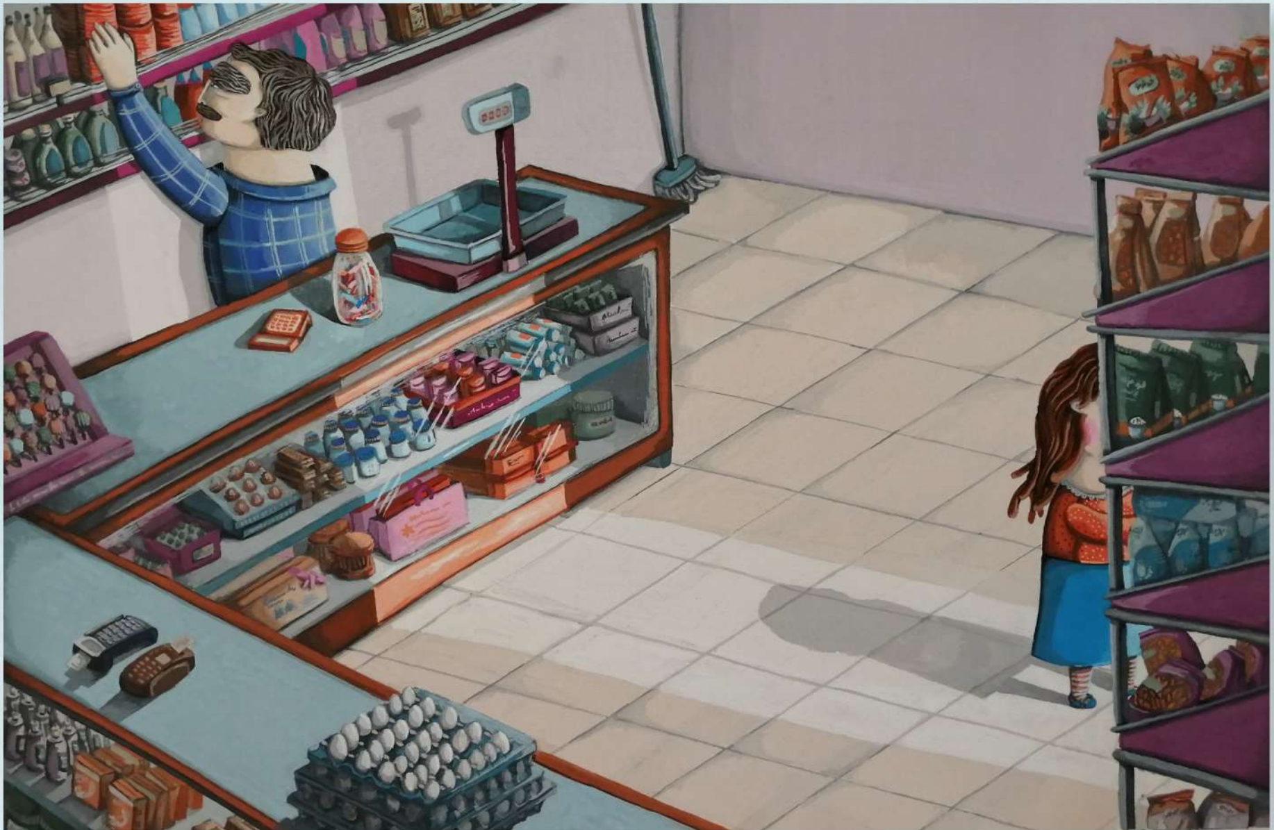
“The shop” frame from the story of “My Doll is Lost”, was performed in gouache technique.